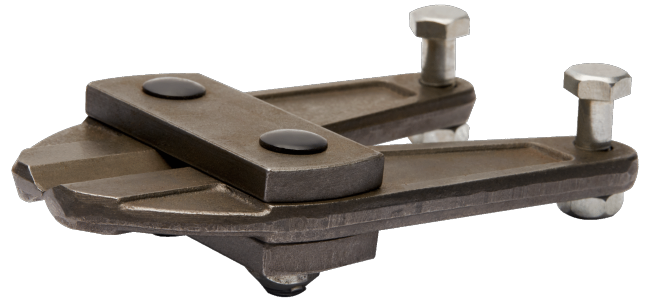
651201N Spare Blade Set for 651101