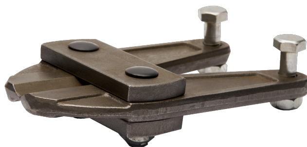
651211N Spare Blade Set for 651111