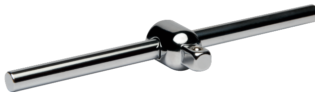
105-42-1 Sliding T-Handle 1/4"