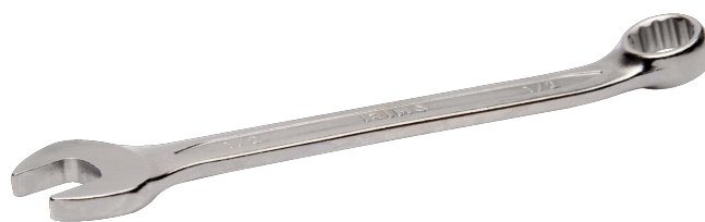
25A-48-1 Combination Wrench 1.1/2", Clip