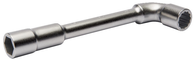
51-32-1 Open Pipe Socket Wrench 6x12, 32 mm, Clip