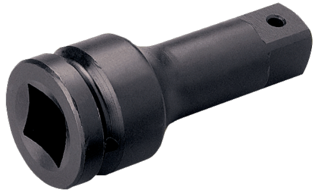
175-10-2 3/4" Impact Extension 250 mm 10"