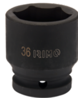
Impact Socket 3/4" Hex 38 mm 173-38-2