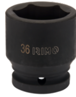
Impact Socket 3/4" Hex 27 mm 173-27-2