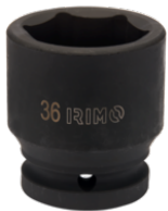
Impact Socket 3/4" Hex 36 mm 173-36-2