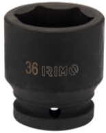
Impact Socket 3/4" Hex 32 mm 173-32-2