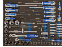
3/3 Foam Sockets, Screwdrivers - 60 Pcs IFF1A004