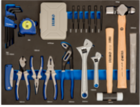
3/3 Foam Striking, Pliers, Bits - 87 Pcs IFF1A005