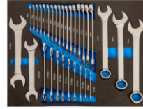
3/3 Foam Combination & Open End Wrenches - 31 Pcs IFF1A006