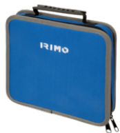
Folder for Tools, Empty, with Strips for 18 Tools 9022-4-26