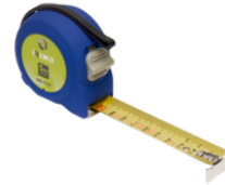
Measuring Tape 3 m x 16 mm 980-3-1