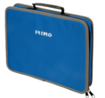
Folder for Tools, Empty, with Strips for 28 Tools 9022-4-35