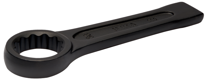
30-27-2 Slogging Ring End Wrench 27 mm