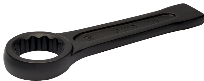
30-32-2 Slogging Ring End Wrench 32 mm