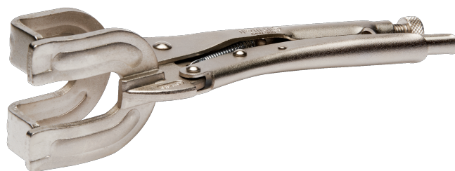
64W-300-1 Welding Locking Pliers 263 mm