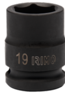
Impact Socket 1/2" Hex 19 mm 167-19-1