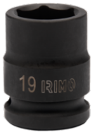
Impact Socket 1/2" Hex 27 mm 167-27-1