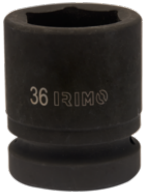
Impact Socket 1" Hex 33 mm 177-33-2