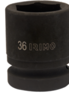
Impact Socket 1" Hex 32 mm 177-32-2