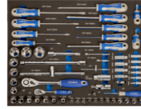
3/3 Foam Sockets, Screwdrivers - 60 Pcs IFF1A004