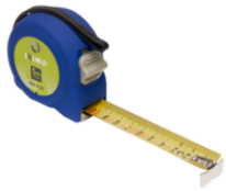
Measuring Tape 5 m x 19 mm 980-5-1