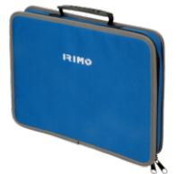
Folder for Tools, Empty, with Strips for 28 Tools 9022-4-35