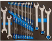
3/3 Foam Combination & Open End Wrenches - 31 Pcs IFF1A006