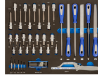
3/3 Foam Socket Bits, Files, Cutting Tools - 44 Pcs IFF1A007