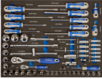
3/3 Foam Sockets, Screwdrivers - 60 Pcs IFF1A004