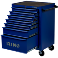
Tool Trolley 26" 7 Drawers 9066K7