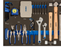
3/3 Foam Striking, Pliers, Bits - 87 Pcs IFF1A005