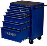
Tool Trolley 26" 6 Drawers 9066K6