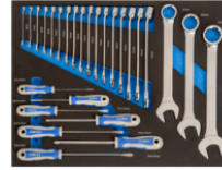
3/3 Foam Combination Wrenches, Screwdrivers - 27 Pcs IFF1A003