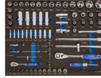
3/3 Foam Sockets, Bits - 94 Pcs IFF1A001