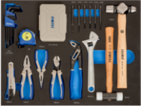
3/3 Foam Striking, Pliers, Bits - 85 Pcs IFF1A002