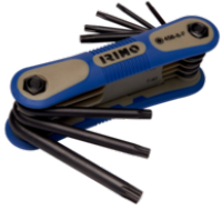
Hex L-Keys Folder Torx 8 Pcs T9-T40 458-8-F